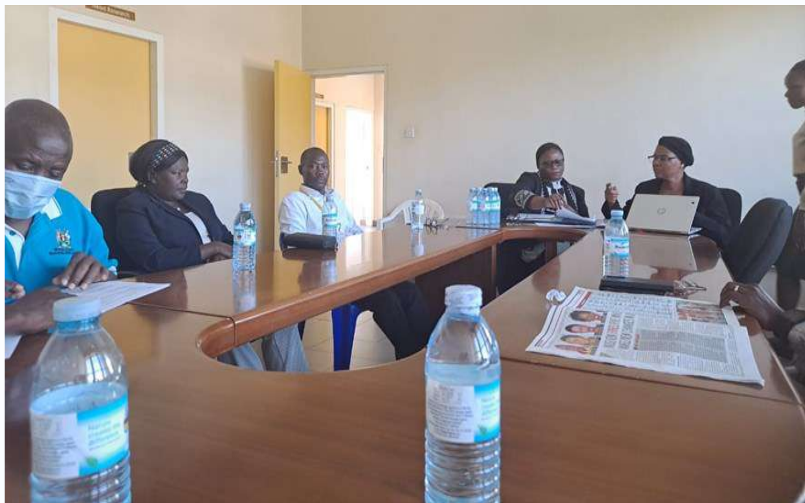
SANA assessor interacting with Mulago Hospital staff and MJAP supported Laboratory Technician at one of the HIV testing points.

We congratulate the team at Mulago Hospital's Microbiology laboratories and thank all partners and stakeholders involved with MJAP for their continued support.