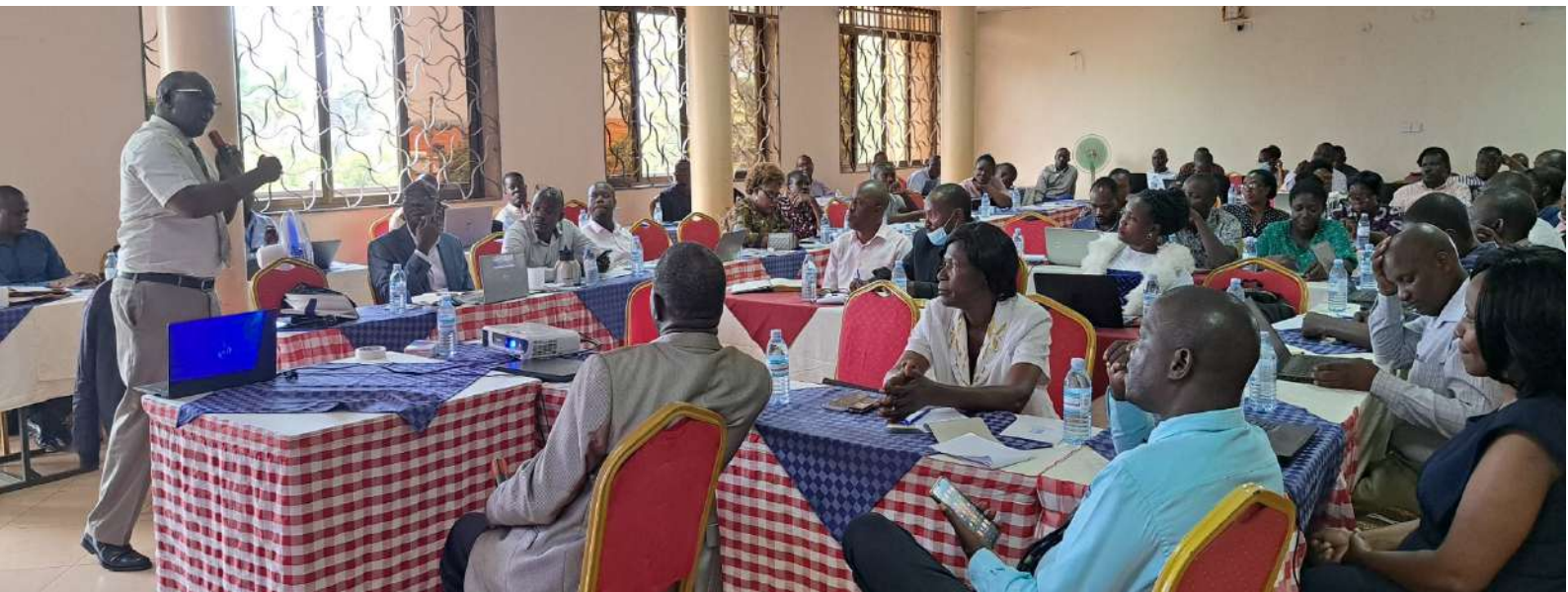
Remarks made by the COP -MJAP -LPHS-EC, Regional DHO chairperson and the meeting was opened by the Director Jinja regional referral hospital.